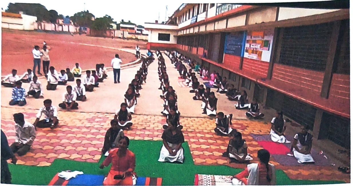
Vegayugadalli Yoga 30 Days Yoga Training Course 2017-18