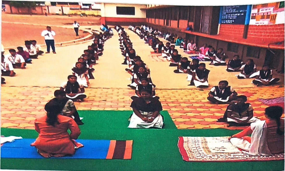
Students Practicing Yoga with the Trainer