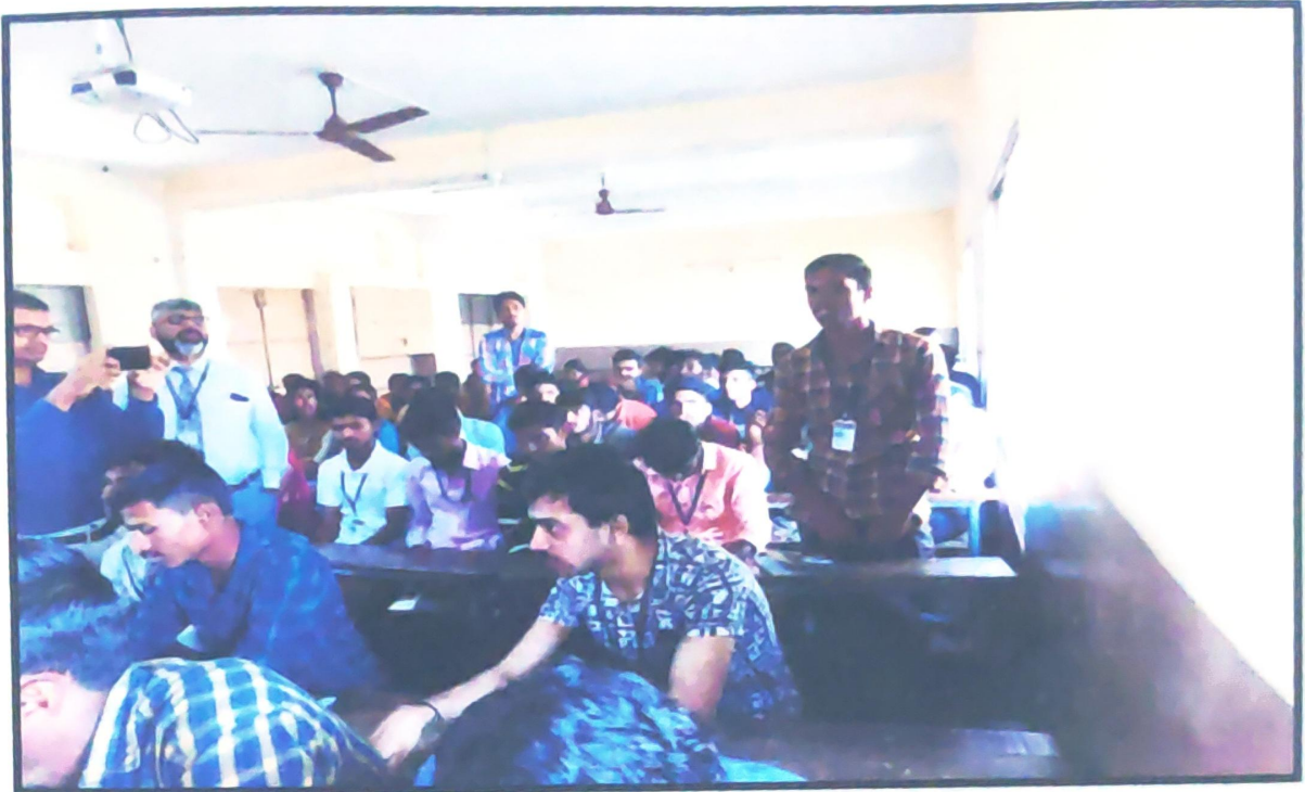
Rabsons Info World Conducted Interaction Classes