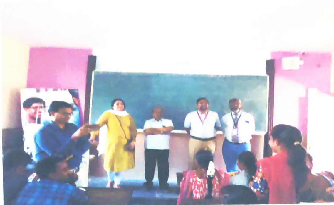
MOU- LOGIC COMPUTER CENTRE DHARWAD