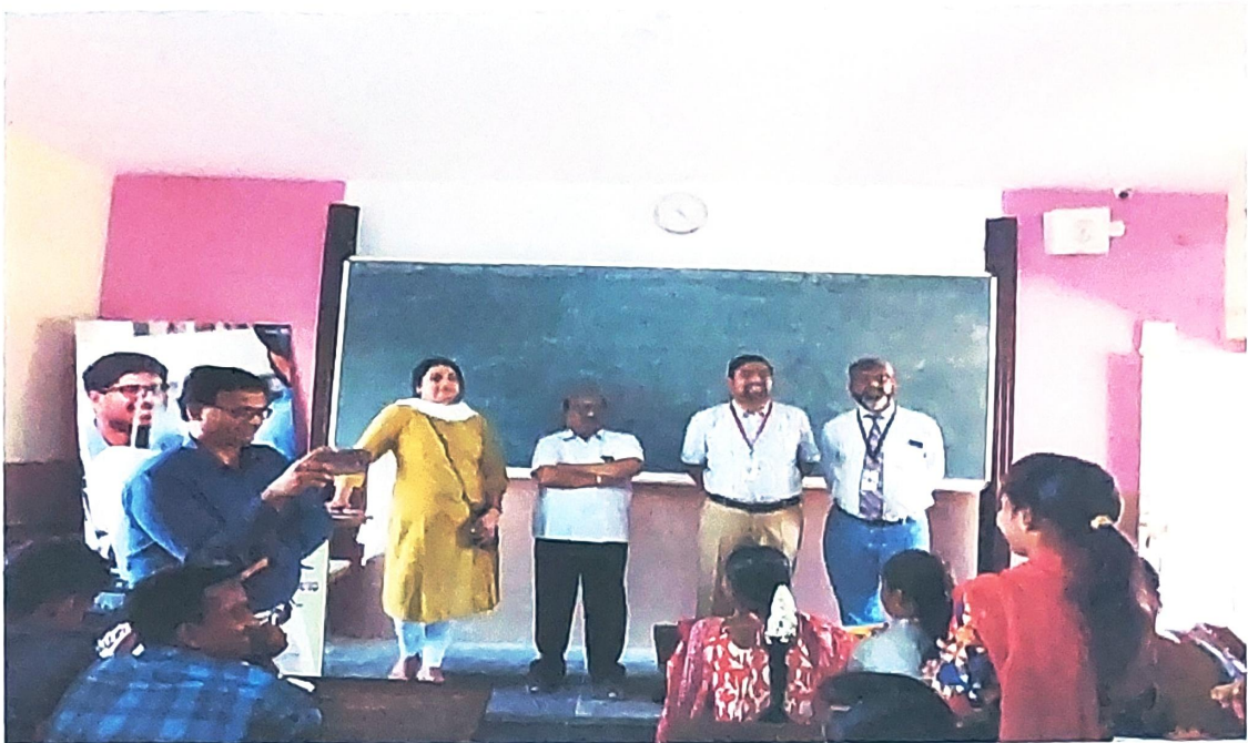
MOU- LOGIC COMPUTER CENTRE DHARWAD