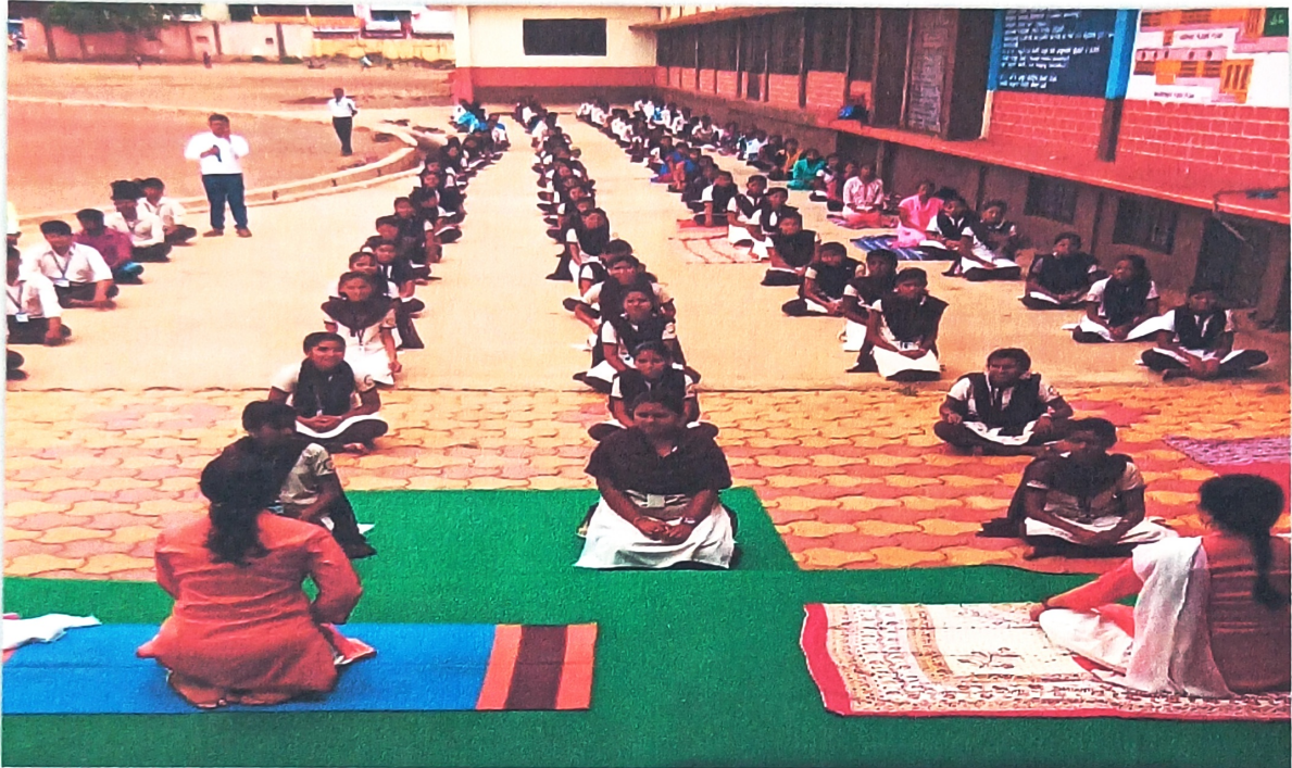
Students Practicing Yoga with the Trainer