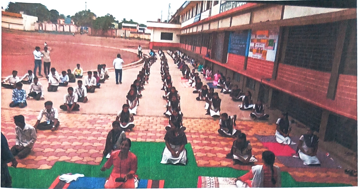
Vegayugadalli Yoga 30 Days Yoga Training Course 2017-18